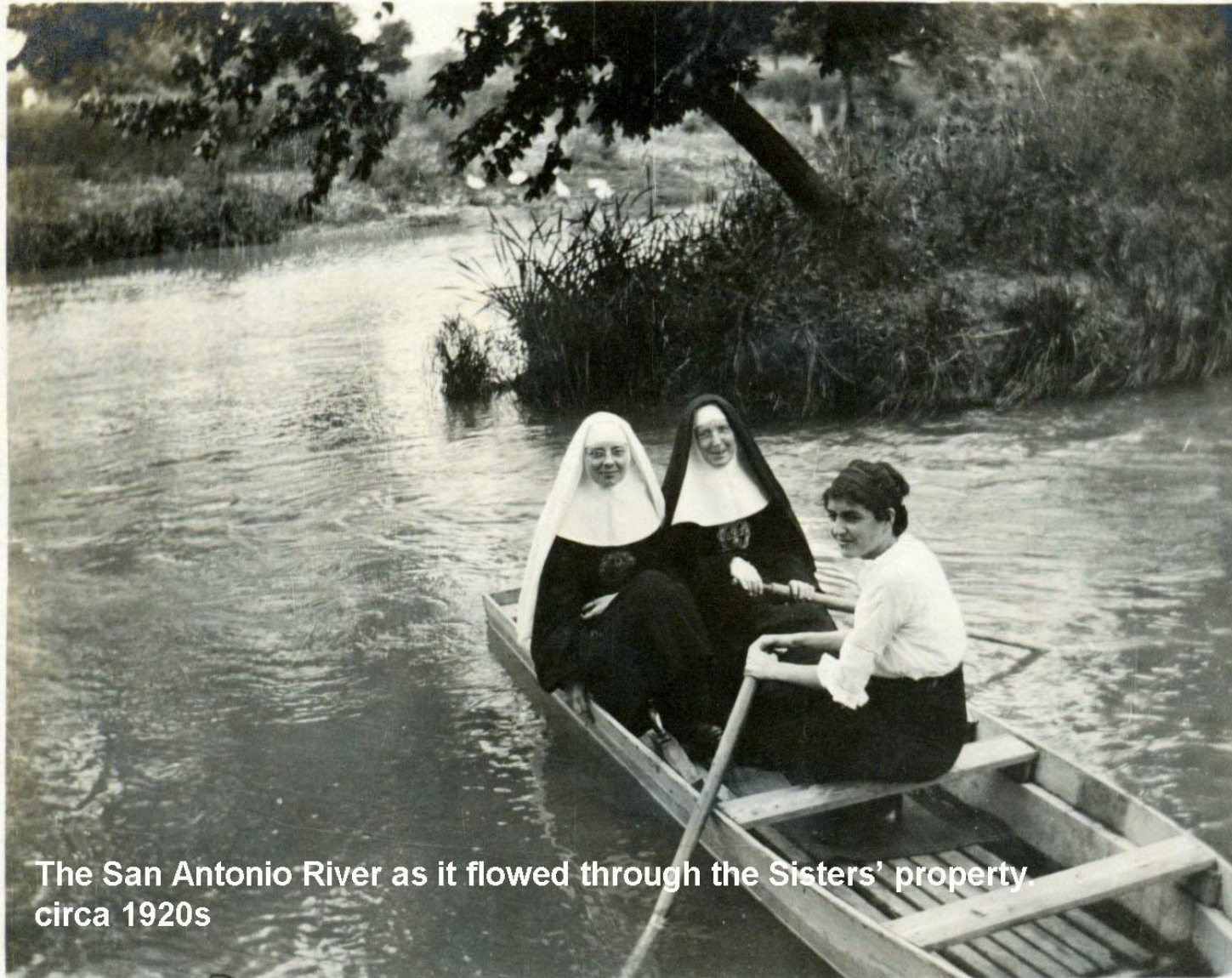
The San Antonio River as it flowed through the Sisters' property. circa 1920s