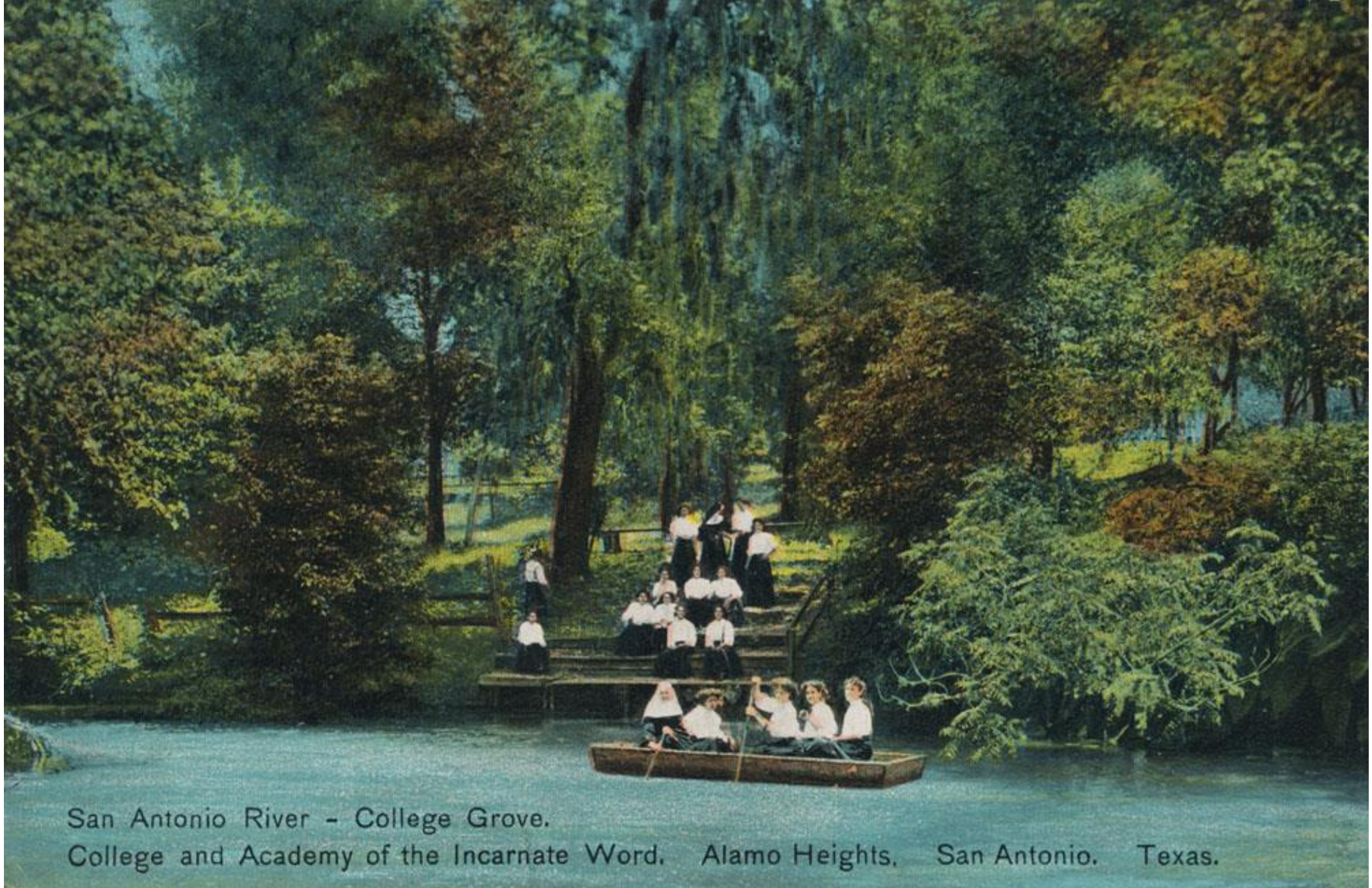
San Antonio River - College Grove. College and Academy of the Incarnate Word, Alamo Heights, San Antonio, Texas.